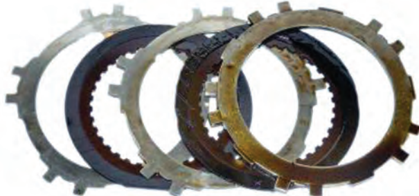
Automatic transmission clutch plates pre-cleanup. Varnish and glazing is heavy on some of the plates.