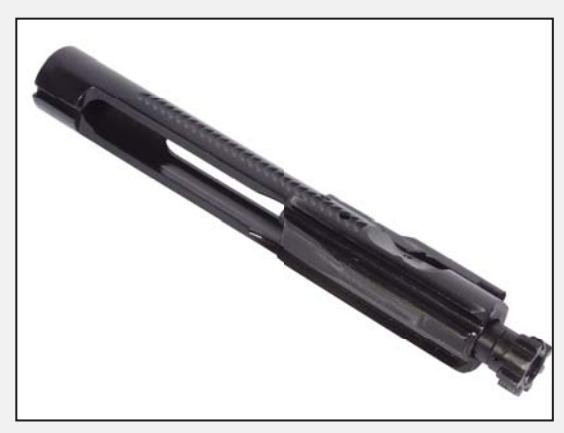
AMSOIL Synthetic Firearm Lubricant provided exceptional performance over rigorous range testing in multiple firearm applications.