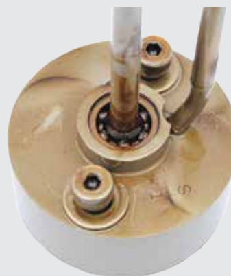
AMSOIL SYNTHETIC MULTI-VISCOSITY HYDRAULIC OIL (ISO 46)